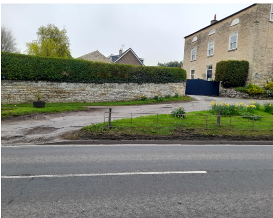
Left. Street view of suggested crossing point, matching arrow as above