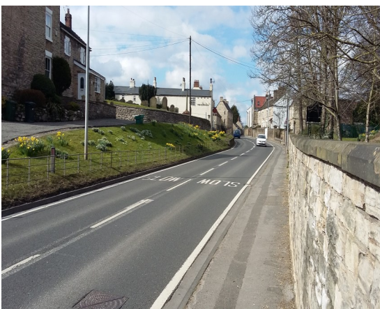
Below. Photo shots of A63 from east and west approaches suggesting ample lines of vision for crossing requirements.